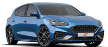
Ford Performance Blue