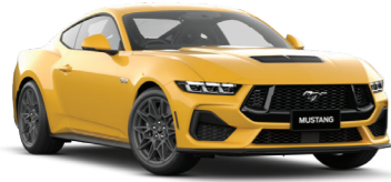
GT V8 Fastback Automatic