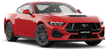
GT V8 Convertible Automatic